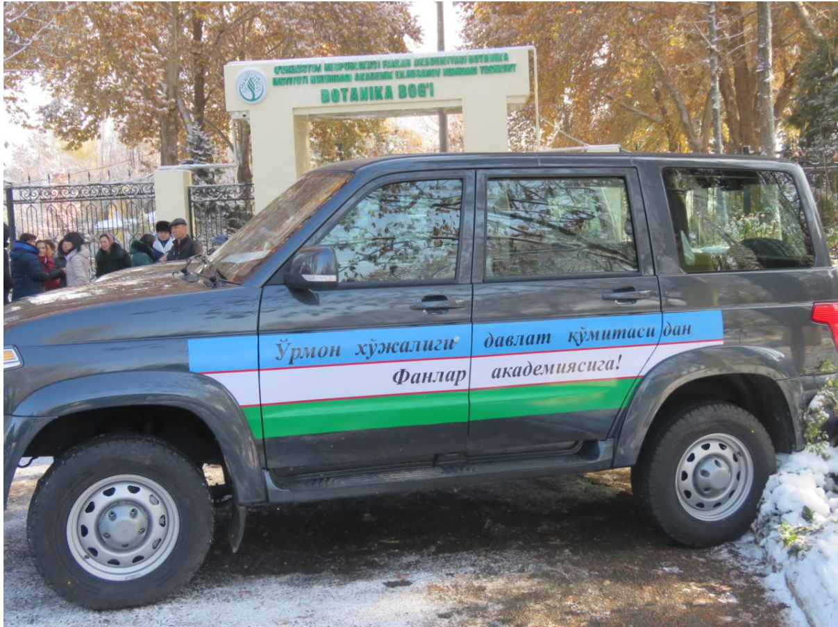
The event highlighted that such opportunities for research can be integrated into research practice.