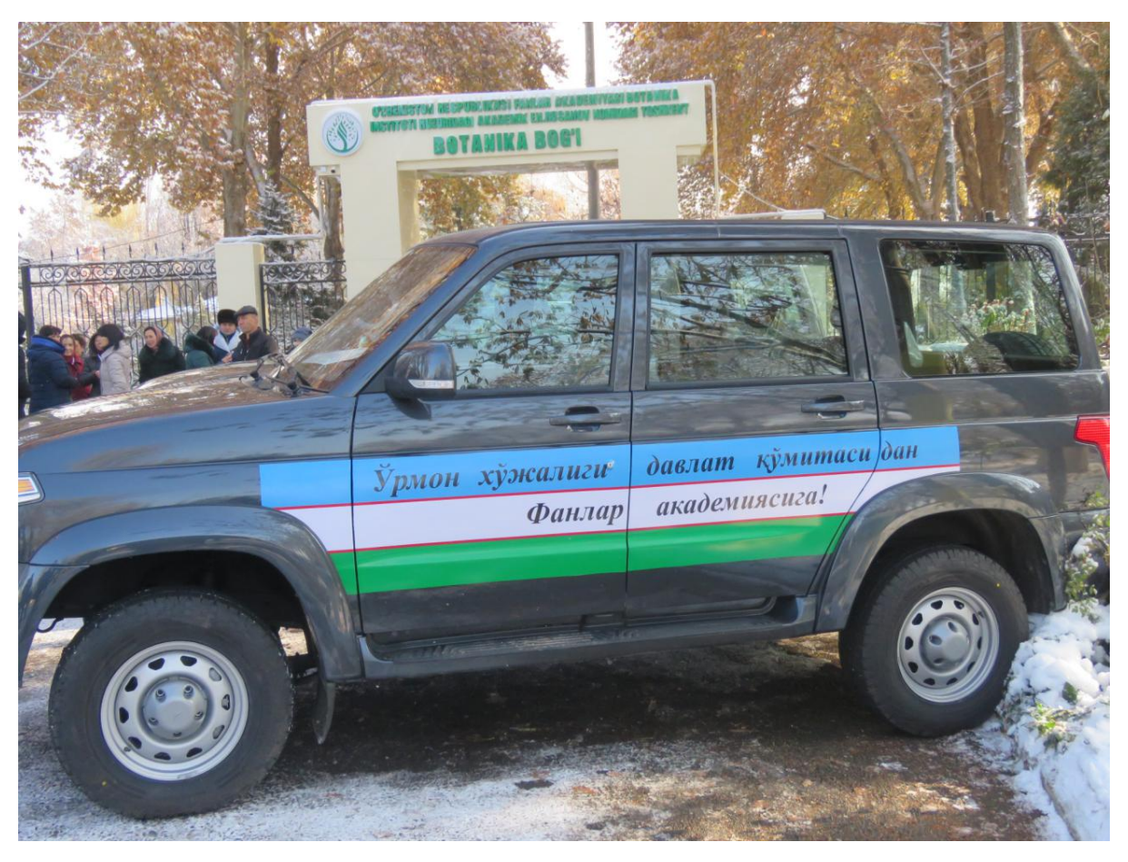
The event highlighted that such opportunities for research can be integrated into research practice.